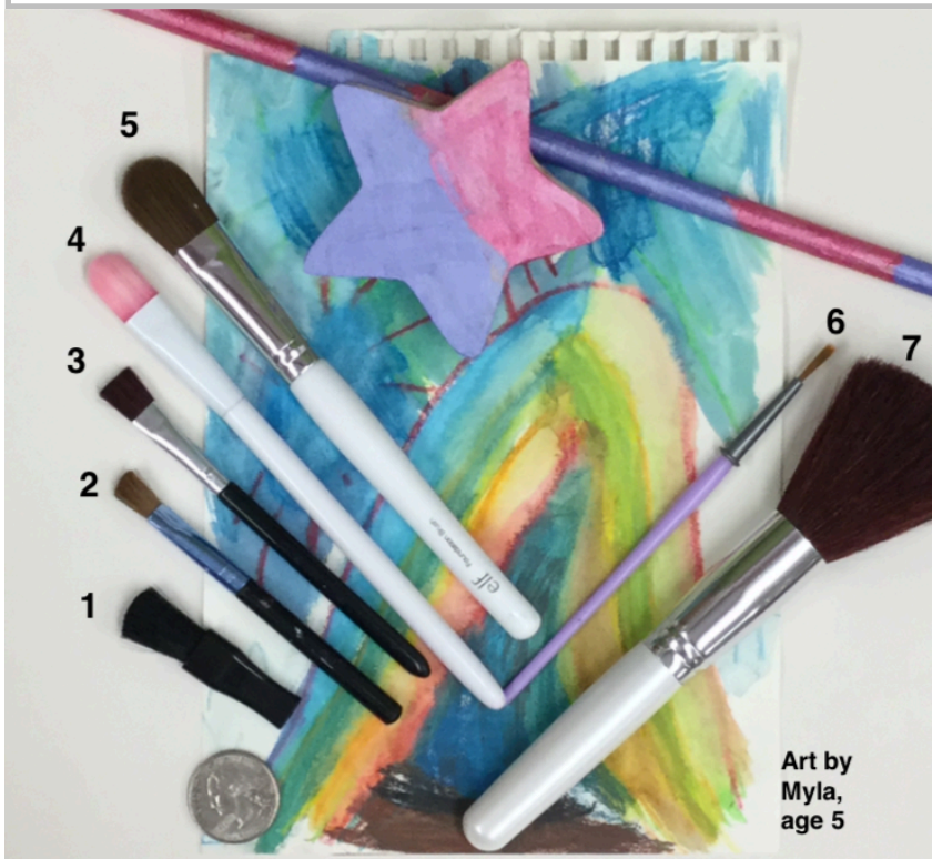
Art by Myla, age 5

Sponge brushes are cheap and can be handy