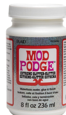
SPECIALTY MOD PODGE: GLITTER, AND GLOW-IN-THE- DARK