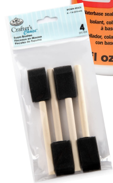
SPONGE BRUSHES WORK WELL WITH MOD PODGE